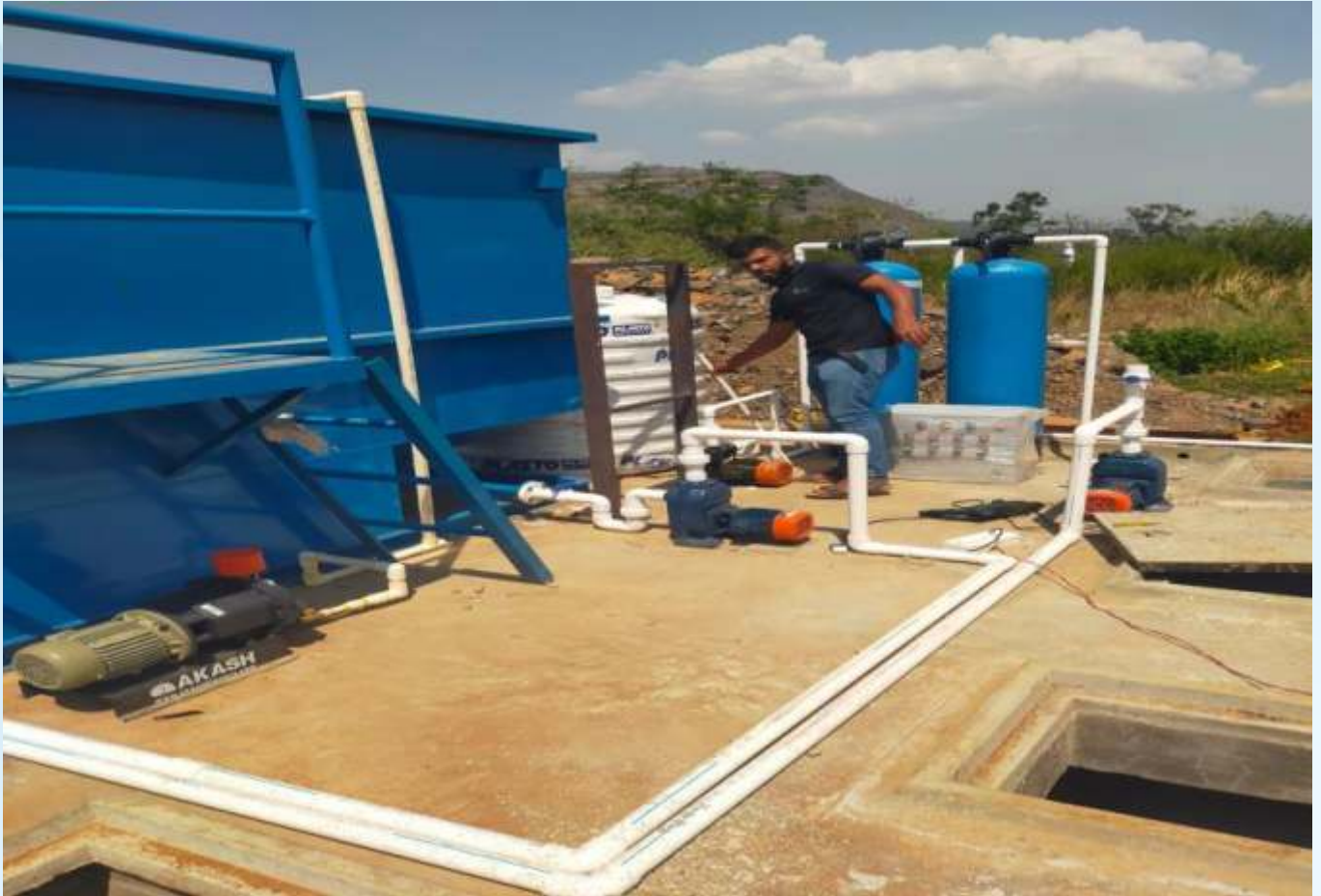
SEAWAGE TREATMENT PLANT