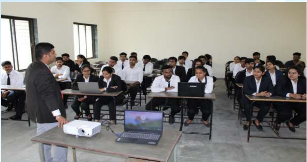
E-LEARNING FACILITY CLASS ROOM