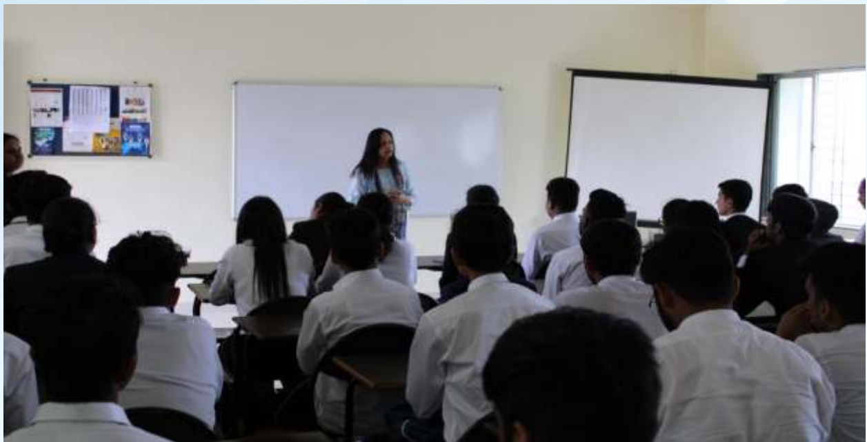
E-LEARNING FACILITY CLASS ROOM