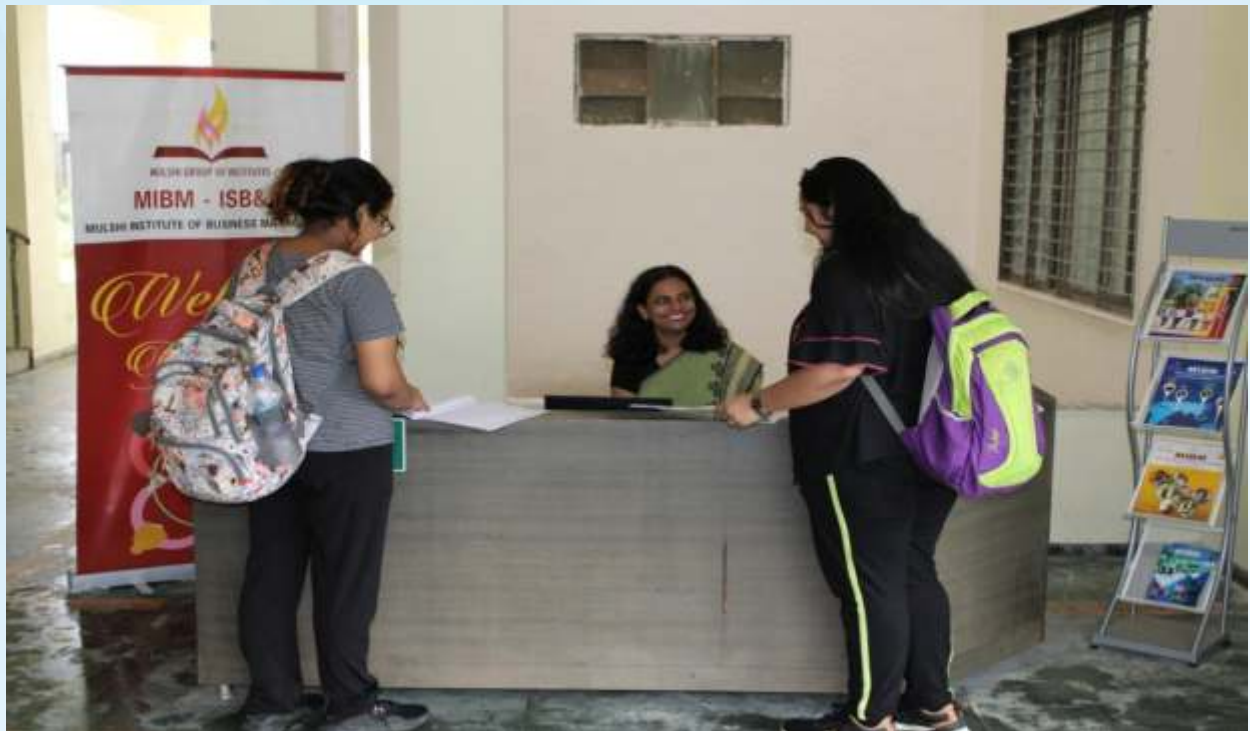
MIBM RECEPTION DESK