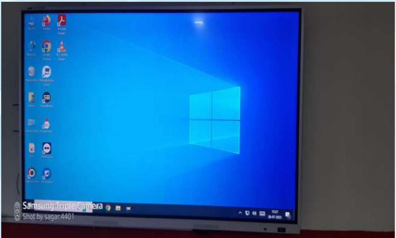
E-LEARNING FACILITY CLASS ROOM